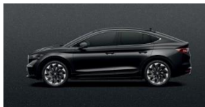
Magic Black Metallic