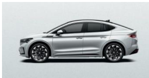
Moon White Metallic