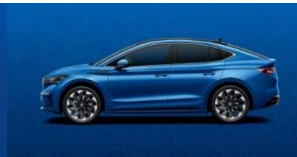
Race Blue Metallic