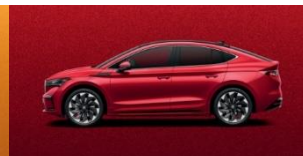
Velvet Red Metallic (+$1,000)