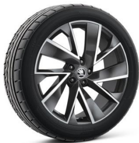
20" Vega alloy wheels