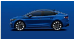
Energy Blue Solid