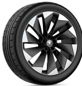
21" Supernova alloy wheels (+$1,500)