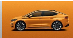
Phoenix Orange Metallic (+$1,000)