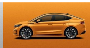
Phoenix Orange Metallic (+$1,000)