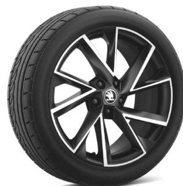
19" 'VEGA' Alloys STANDARD ON SPORTLINE'