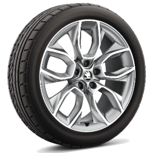
19" 'CRATER' Alloys STANDARD ON STYLE TDI

* Fuel consumption values obtained using WLTP Standard - http://www.skoda.co.nz/owners/wltp